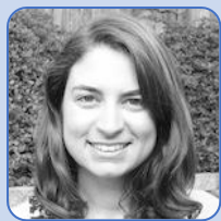
❖ [redacted] Charlotte Mason