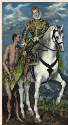
Painting illustrating St. Morten Bisp on his horse.

More recently, Saint Morten is the reason for Mortensaften's festively celebrations in several northern countries. With a rider dressed as Morten, lantern processions in Flanders and regions of Germany are part of the celebrations. In Denmark, Skåne and other regions of Germany, traditional goose roast - mortensgås , which today has become roasted duck - mortensand , is the star of the evenings menu.