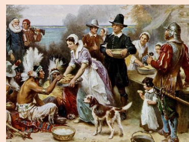
Thanksgiving portrait in 1621

Thanksgiving is a federal holiday in the United States, celebrated on the fourth Thursday of November. It is sometimes called American Thanksgiving to distinguish it from the Canadian holiday of the same name and related celebrations in other regions.