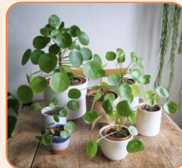
Pilea Peperomioides (chinese money plant)

Light: bright, indirect light / Water: Once a week, allow to dry out between waterings / Humidity: medium to low / Potting: needs good drainage / Tips: thrives in terracotta pots, don't allow direct sunlight, it will burn the leaves.