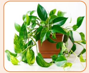
Epipremnum aureum (pothos)

Light: bright indirect light / Water: every 1-2 weeks, allow to dry out between waterings / Humidity: thrives in high but tolerates low / Potting: Needs good draining / Tips: Great as a hanging plant.