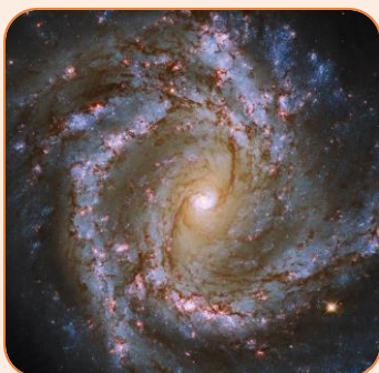
Hubble takes a Spiral Snapshot.