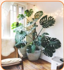
Monstera deliciosa (cheese plant)

Light: bright to medium indirect light / Water: every 1-2 weeks, allow soil to dry out between waterings / Humidity: normal to high / Potting: well drained, ideally a pot with a hole in the bottom / Tips: most likely to die from overwatering and wet feet, so don't overwater and keep it in a well-drained pot.