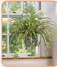
Chlorophytum comosum (spider plant)

Light: Bright indirect light / Water: every 1-2 weeks, allow to dry out between waterings / Humidity: thrives in high, tolerates low / Potting: needs good drainage / Tips: Can be easily propagated by planting the small "spiderettes" that appear in spring.