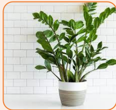
Zamioculcas zamiifolia (zz plant)

Light: low to medium indirect light / Water: every 2-3 weeks, allow soil to dry out between waterings / Humidity: medium to low / Potting: well drained potting mix / Tips: Great for offices, virtually indestructible.