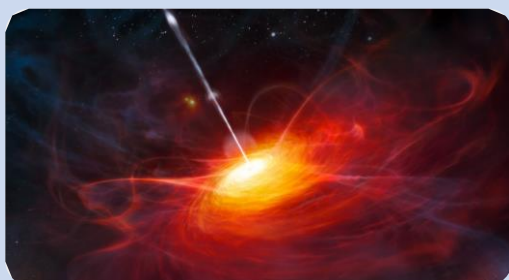
Artist's impression of the quasar ULAS J1120+0641

New analysis leads to a fundamentally different view of supermassive black holes! For the second time as a 1 st Author in the Pub Club - Congratulations John!